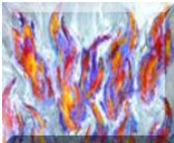
Tongues of Fire

Let’s move with Holy Ghost deeper into Revelation of this Light of Truth!